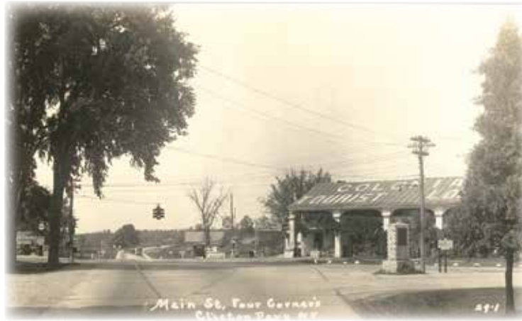
Postcard View, Main Street, Four Corner's, Clifton Park, NY showing the Clifton Park Hotel, 1931