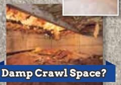
Damp Crawl Space?

Basement Waterproofing • Humidity & Moisture Control • Egress & Basement Windows • Bowing Walls • Foundation Settling • EZ Post Helical Deck Piers • Concrete Lifting & Stabilization • And Nasty Crawl Spaces Too!