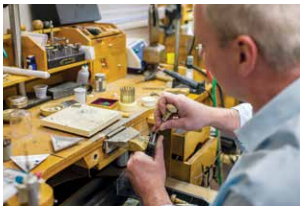
Visit hoffjewelers.com for wedding proposal ideas and info on diamond selection, custom options, birthstones and jewelry care.

"My favorite part about this business is the ability to serve the community I have called home for