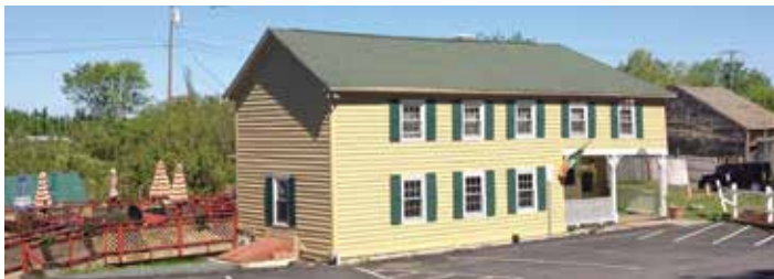
Powers Inn and Pub, 130 Meyer Rd. Clifton Park, 406-5561, Hours: Sun, Tues-Thurs 11:30am-midnight (kitchen closes at 10pm), Fri-Sat: 11:30am-2am (kitchen closes at 11pm), powersinnandpub.com .