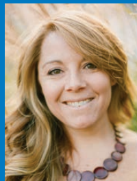
Tara Wiley Tara Wiley Photography