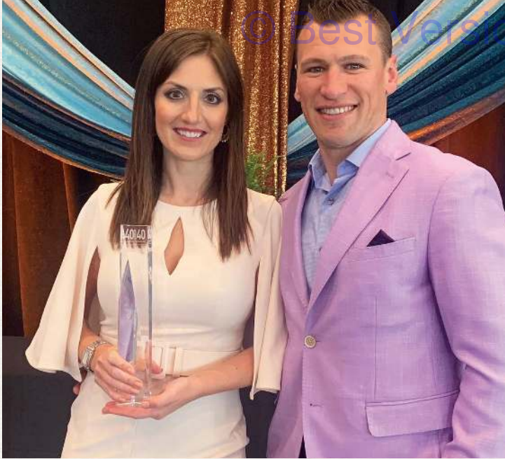
40 Under 40 Award

Her work there has not gone unnoticed. She was recently honored by the Albany Business Review as one of 2022's 40 Under 40 Top Professionals. As one of over 300 nominees, the award was a special honor for her. She also just won the 59 th Anniversary American In-House Design Award™. As the oldest and largest program for in-house creative excellence, this is a very prestigious award with more than 7,000 entrants. Her work for GE's Cutting Carbon Podcast logo and episode graphics was one of the top 10% winners.