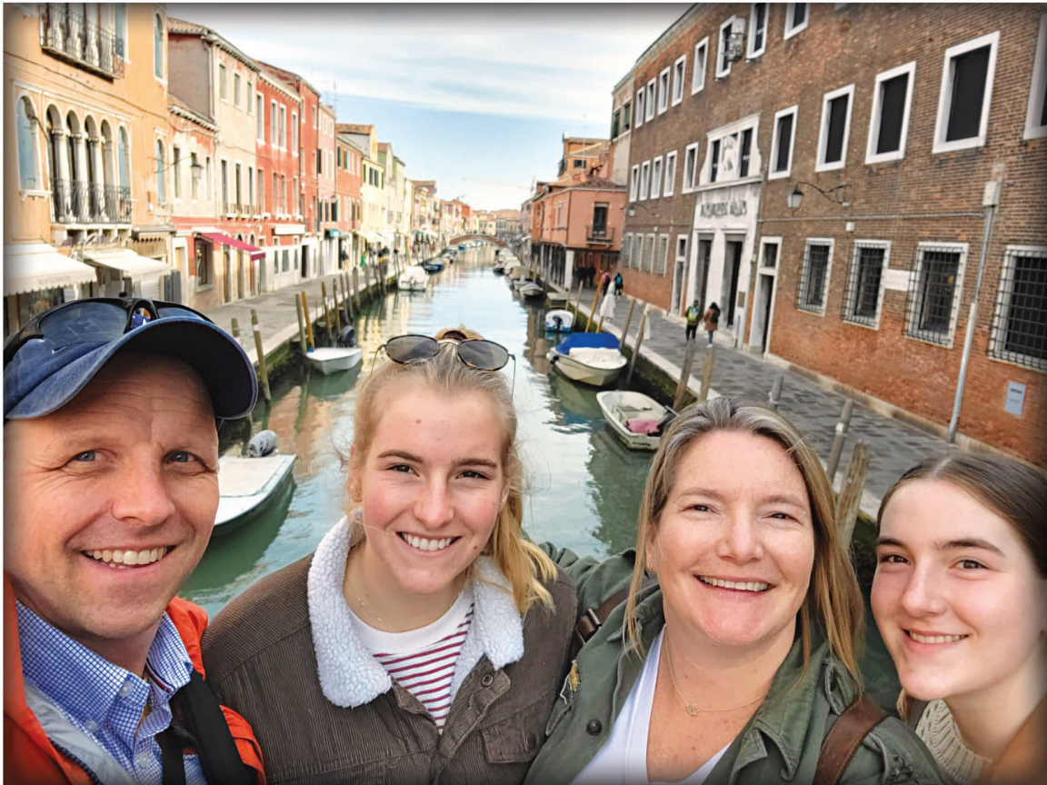
Beltramo family in Venice

BY JENNA CAPUTO | PHOTOS BY MIA ERTAS PHOTOGRAPHY & CONTRIBUTED BY THE BELTRAMO FAMILY