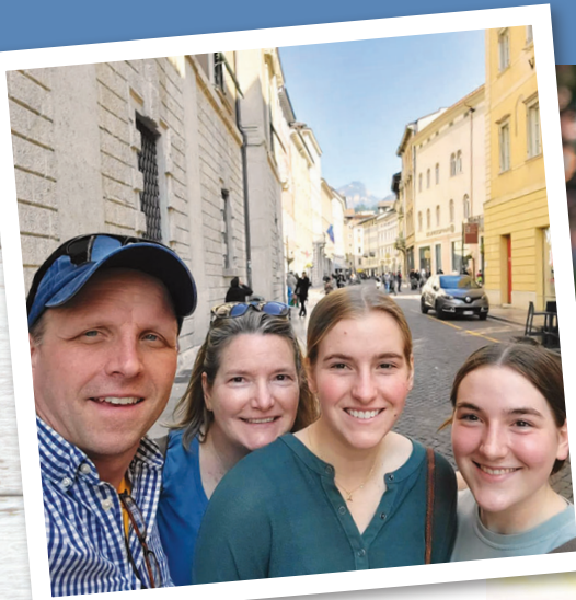
Beltramo family in Trento Italy