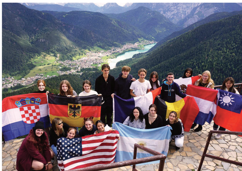
Rotary Inbound Exchange students in the Dolomites